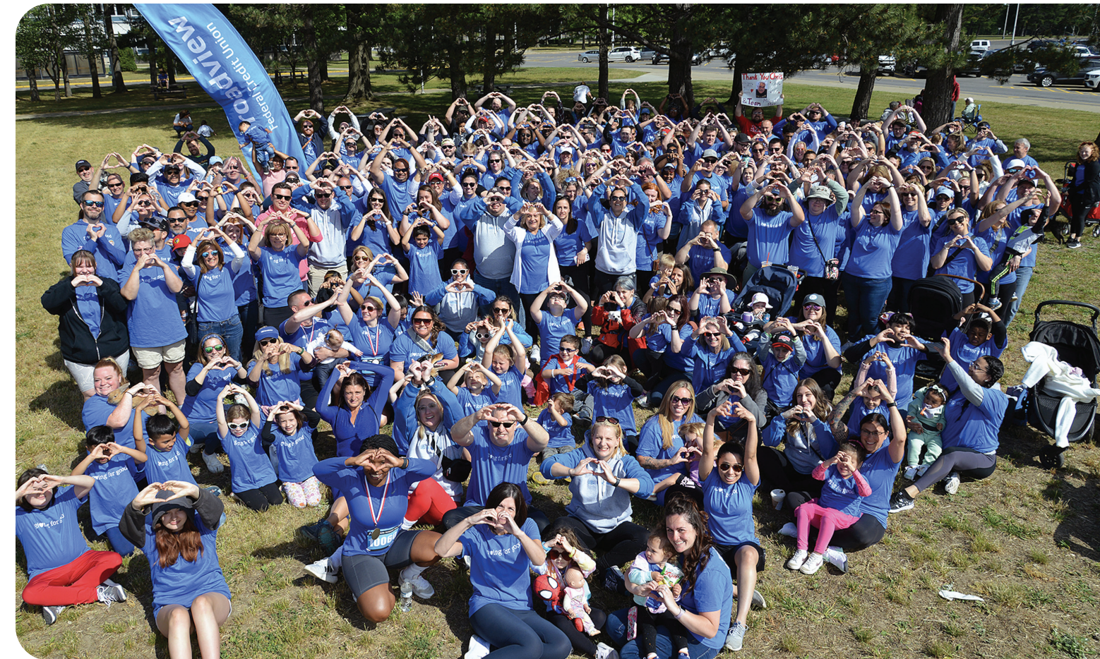
Broadview Heart Walk