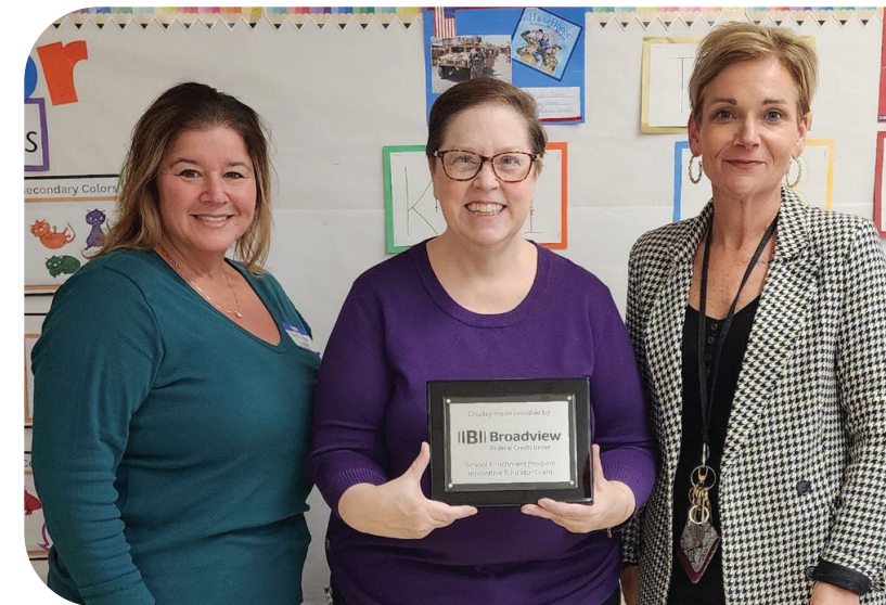
Broadview Innovative Education Grant Recipient