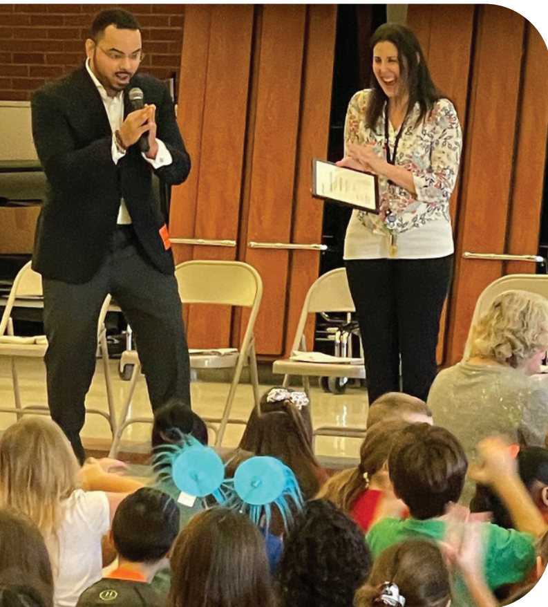
Broadview School Enrichment Program

Catholic Central School Chango Elementary Cohoes High School Delaware Community School Donald P Sutherland School Eagle Elementary School Eagle Point Elementary School Forest Park Elementary School Giffen Memorial Elementary School Glen-Worden Elementary Green Tech Charter School Guilderland Elementary Guilderland High School Holy Spirit School King Center Charter School KIPP Troy Prep Middle School Lansingburgh High School Lincoln Elementary Community School Loudonville Elementary New Scotland Elementary School Okte Elementary Paige Elementary Pine Bush Elementary Pine Hills Elementary School Ravena-Coeymans-Selkirk Middle School Red Mill School Roots Academy at West Hill (formerly Philip J. Schuyler) Sacred Heart Troy Saddlewood Elementary Saint Gregory's School Sand Creek Middle School Schalmont Middle School School 2 - Troy Shatekon Elementary School Sheridan Prep Skano Elementary St Pius X School St. Marys Institute Stillwater Elementary School Tamarac Elementary School Troy Middle School Watervliet Elementary Western New York Maritime Charter School William C. Keane Elementary School Woodland Hill Montessori School