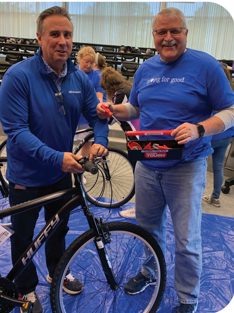
Broadview Bike Build