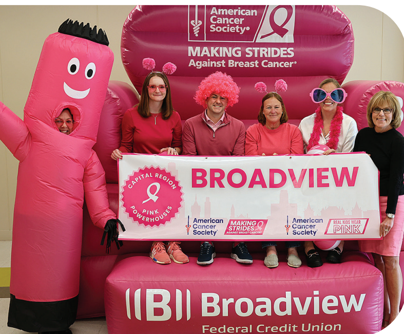
Real Kids Wear Pink

We closed the year with more than 20,000 leafy greens