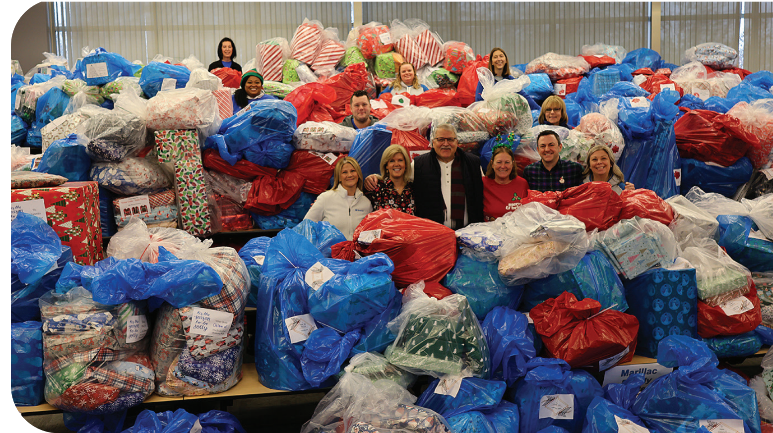
Broadview Holiday Sharing