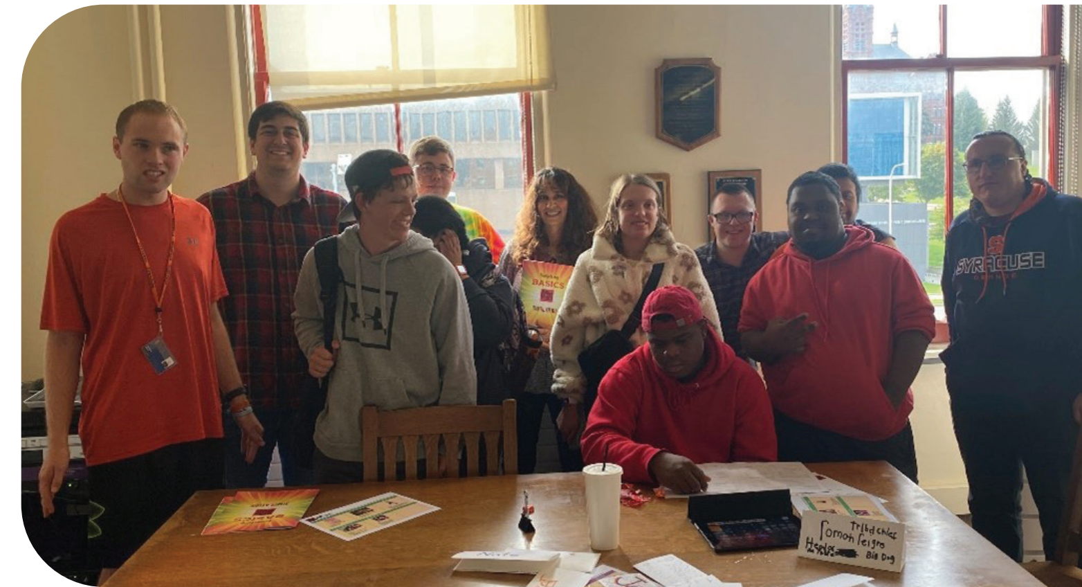
Syracuse University's Inclusive U Program

In 2020, COVID-19 emergency relief temporarily paused federal student loan payments and set interest rates to 0%. That pause expired in October, meaning many borrowers with federal student loans began repayment for the first time in three years. In response, Financial Well-Being created "Saving for Repayment – Budgeting and Student Debt," a new educational webinar focused on available student loan repayment plans, the new student aid loan simulator tool, new options for $0 federal loan payments, and tools for effective budgeting.