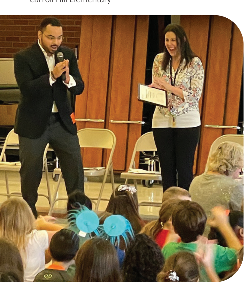
Broadview School Enrichment Program