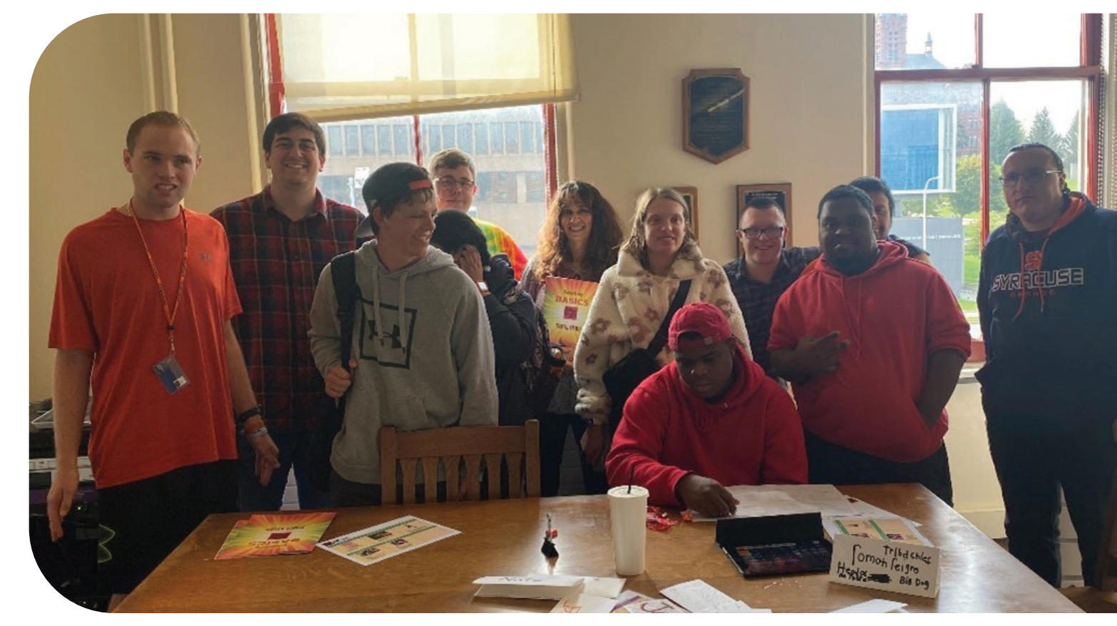
Syracuse University's Inclusive U Program

Members impacted by federal student loan reinstatement were invited to join one of Broadview's four student loans webinars starting in late September. Providing current and topical financial education through various delivery methods was a top priority for the team, including exploring new methods to reach participants with short, digestible money management content. This fall, five new mini-course videos were distributed. These short, two-minutes videos shared financial facts, tips for improving money habits and additional information to access financial wellness services at Broadview. The video series focused on key topics including fraud prevention, budgeting, goal setting, debt-to-income ratio, and credit building.