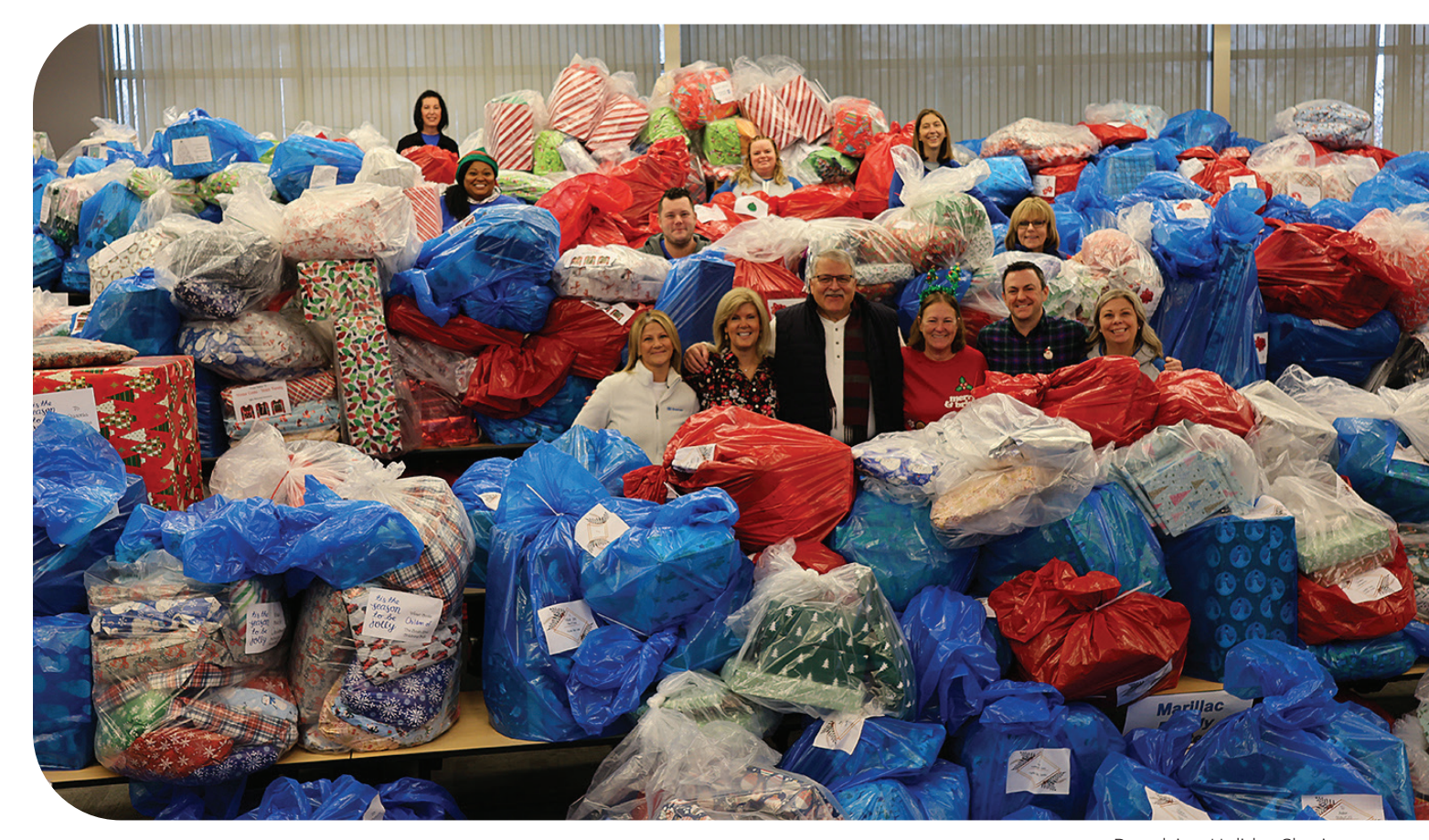
Broadview Holiday Sharing